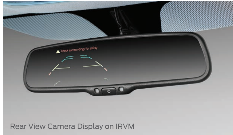
Rear View Camera Display on IRVM