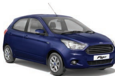
Deep Impact Blue