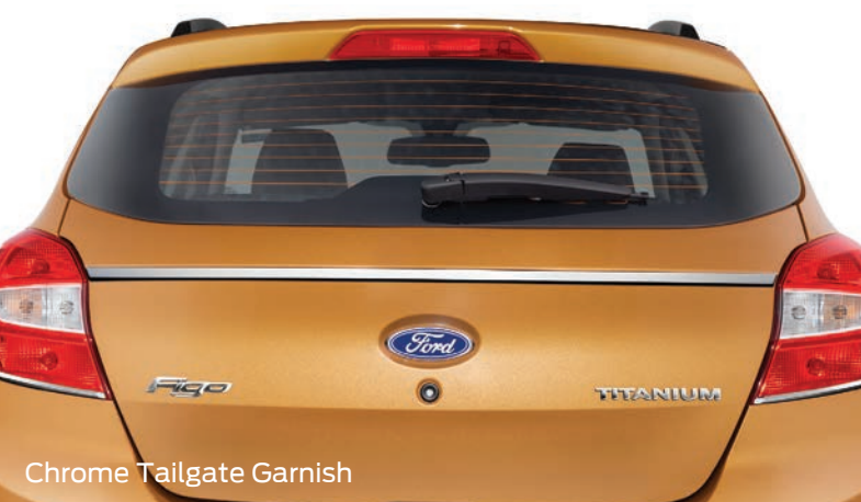
Chrome Tailgate Garnish