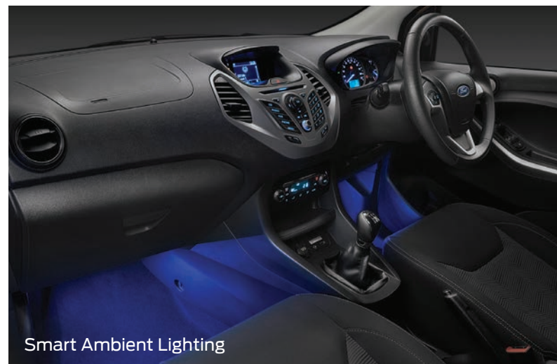
Smart Ambient Lighting