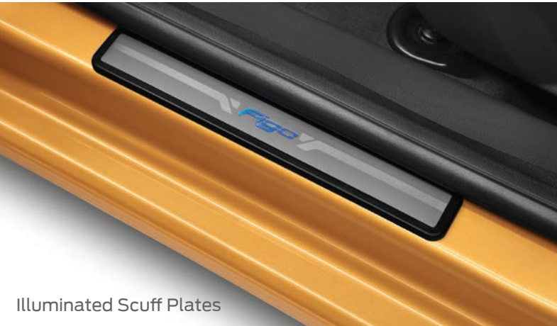
Illuminated Scuff Plates

Make your Next-Gen Figo even more vibrant with its range of accessories. We've got what you need when it comes to style.