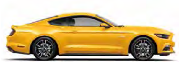
Triple Yellow Tri-coat