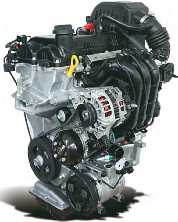
Dual VTVT 1.0L Kappa Engine

Hyundai has always been committed to making safe cars that are fuel efficient and easy to maintain. The EON is no exception. Powered by a mileage-friendly engine and features that help promote eco-friendly driving, this car is easy both on your pocket and the environment.