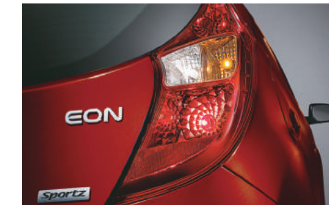
Moon Shaped Tail Lamps