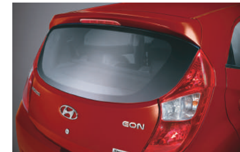
Integrated Spoiler with HMSL