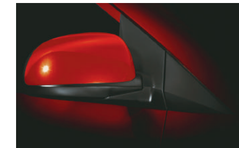
Body Colour Mirrors