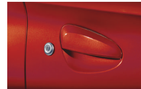
Body Colour Door Handles