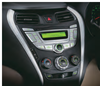
AC & 2 DIN Audio with AUX-in & USB Ports

When it comes to comfort or convenience, the Hyundai EON boasts of both in equal measure. It contains all the features you'll ever need, well designed and placed within easy reach.