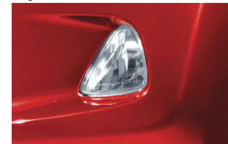
Front Fog Lamps