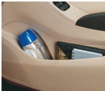
Map Pocket with Bottle Holder