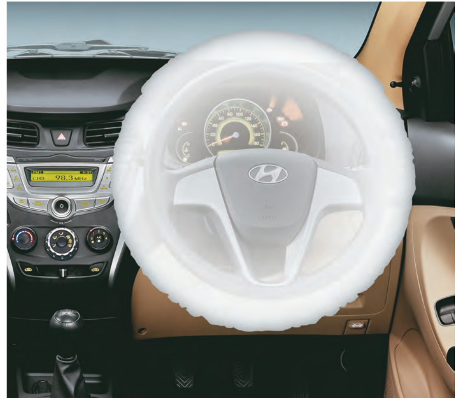
Driver Side Airbag