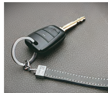
Keyless Entry & Central Locking