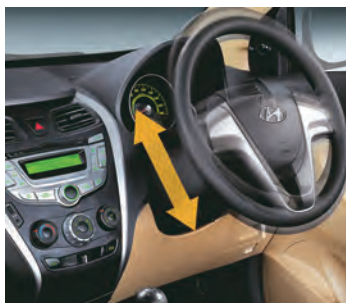
MDPS with Tilt Steering