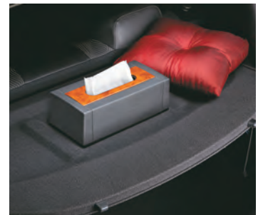
Rear Parcel Tray