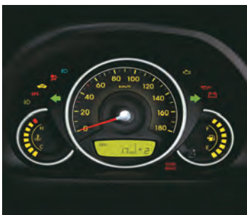
Instrument Panel with Gear Shift Indicator