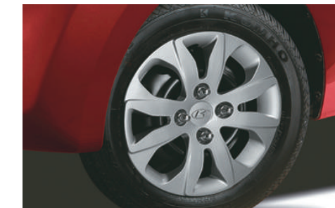
Full Wheel Cover