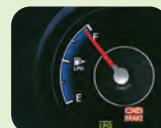
LPG fuel gauge