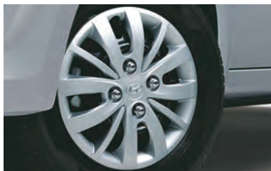
Full Wheel Cover

The Next Gen i10 is simply irresistible and speaks volumes about class and innovation from every angle. From the 2 DIN Audio, the AUX & USB ports to the tilt steering and full wheel cover, everything is designed to make the drive more convenient and comfortable.