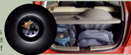
Tank capacity (water filling)/34 litres

The company fitted Toroidal LPG tank is specially designed and is smartly located so that it does not use up much of the useful boot space.