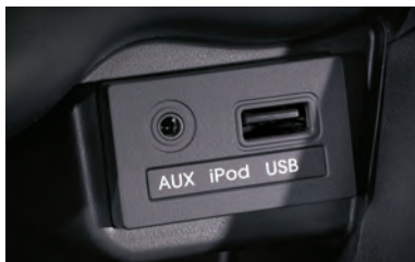
AUX and USB Ports