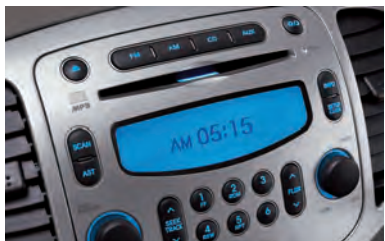
2 DIN Radio+CD+MP3 Audio