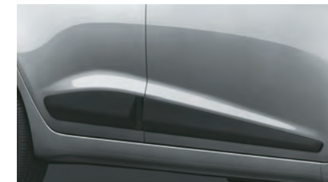
WAISTLINE MOULDING Imparts a sporty look and prevents scratches to the body