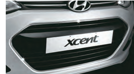
CHROME RADIATOR GRILLE & AIR DAM Projecting a strong road presence