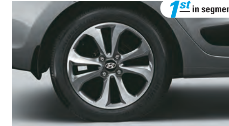
R15 DIAMOND CUT ALLOY WHEELS With 2-tone black and chrome finish for a sporty and dynamic appeal