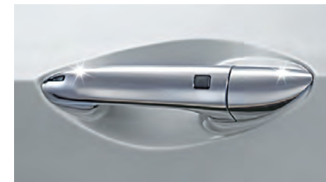
CHROME DOOR HANDLE Adds a premium look to the overall profile of the car