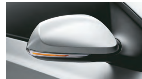
OUTSIDE MIRROR WITH TURN INDICATOR Aerodynamically designed to enhance looks and safety