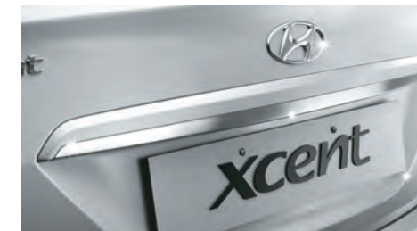
REAR CHROME GARNISH Highlights the rear profile of the car