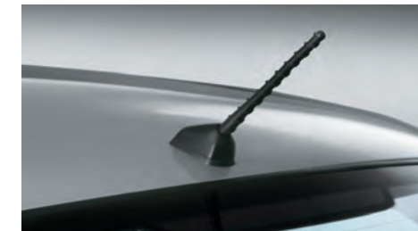
MICRO ROOF ANTENNA For efficient radio connectivity and aesthetic appeal