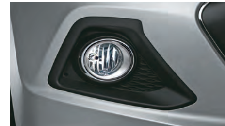
FOG LAMPS Designed for optimum amplification and to ensure safety during foggy weather conditions